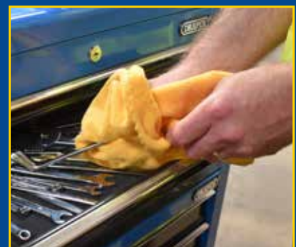
Tools & Surfaces