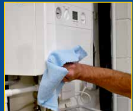
Heating & Engineering