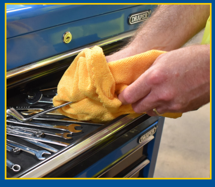
Tools & Surfaces