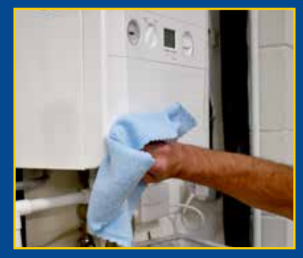
Heating & Engineering